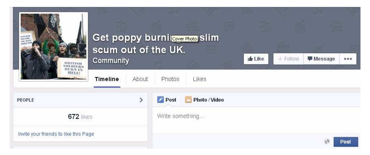
Figure 4: Get poppy burning Muslim scum out of the UK

Similarly, the 'ban Islam in Australia' page has been much more successful at gathering widespread support for the anti-Muslim hate elements they have been posting (see figure