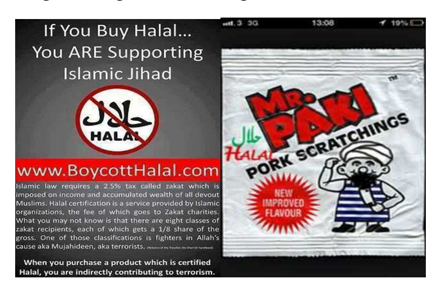
Figure 3: English Defence League Posts on Halal Food

Moreover, the 'Get poppy burning Muslim scum out of the UK' page was created as a direct result of the now banned group Islam4UK actions in burning poppy's in relation to Britain soldiers involvement in the wars in Iraq and Afghanistan. In May 2013, it began sending posts out following the Woolwich attacks in order to gather support and create further anti-Muslim rhetoric. The page has 672 likes (at the time of writing) but seems to be operating on the basis of reactionary events such as Woolwich and others. Clearly, this page and others similar to this, act as virtual repositories of news feeds that marginalise and demonise Muslims communities.