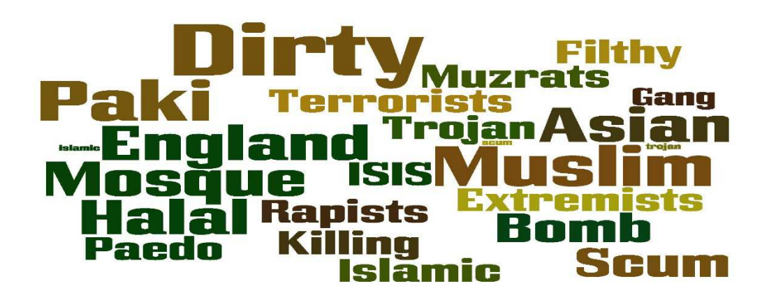
Figure 1: Word Cloud representing most common reappearing words

The use of the terms Muzrats, Paedo, Paki, Rapists, Scum and Terrorists were used in relation to Muslims as a means to whip up an anti-Muslim backlash. Interestingly, the terms used here also show a worrying trend in which groups like the English Brotherhood and the Ban Islam pages and other specific individuals were framing a large part of the