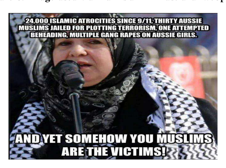
Figure 6: Image used via 'Ban Islam in Australia' webpage

Below is an image (see figure 6) used via the 'Ban Islam in Australia page' which received considerable comments and posts regarding Muslims.